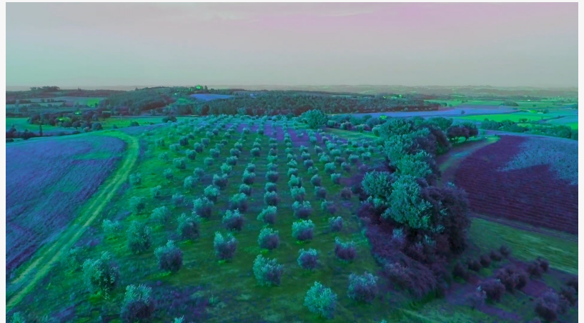
The Garden of Secrets encourages viewers to look at nature from a radically different perspective.