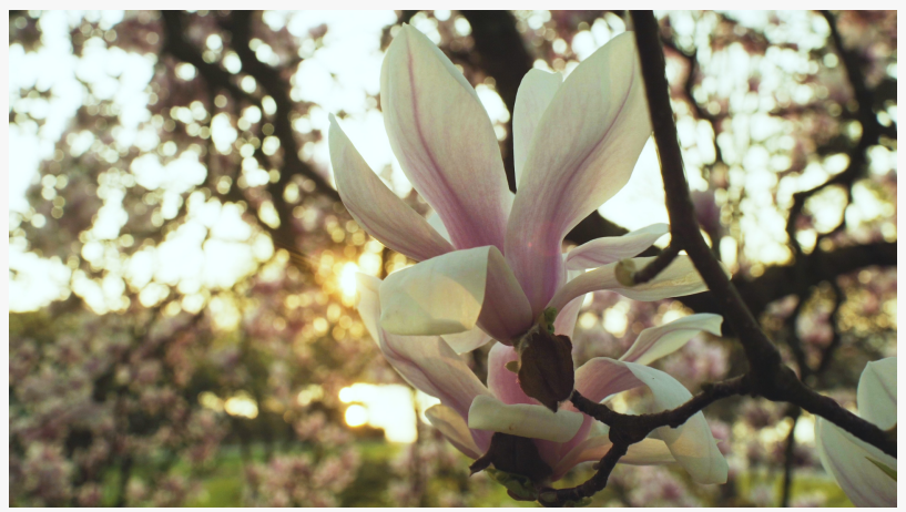
The Garden of Secrets documentary is a philanthropic project in support of botanical gardens.