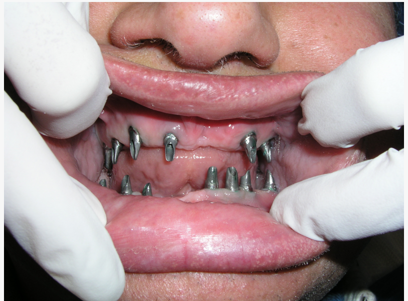
Bone grafts, implants and abutments

The fast-growing number of the implant retained restorations made it possible to collect clinical information for the development of better implants and abutments. More and more attention turned to the gum around the implant beside the integration of the implant surface and bone. The lack of necessary bone inspired the development of bone grafts . The permanent development of periodontal, prosthodontic and surgical methods could describe this period. The number of appointments and the cost of the treatment has been increased.