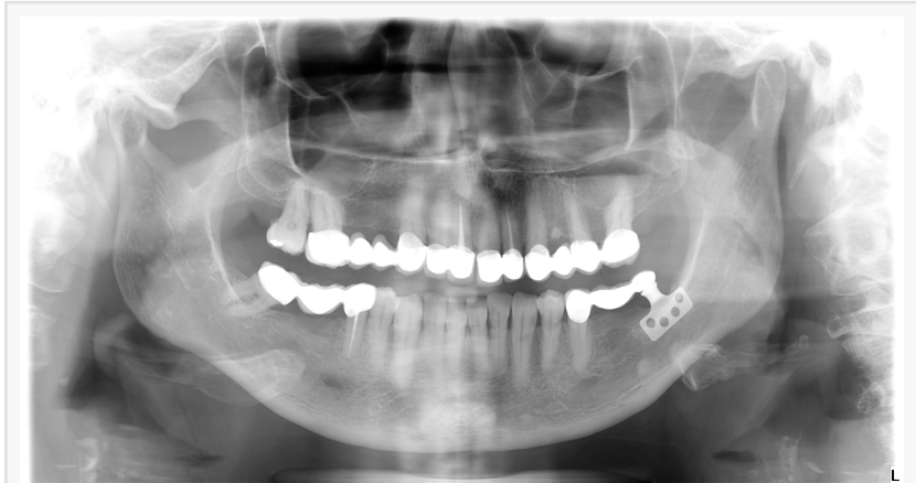
Implants used in our practice 40 years ago

The spread of the modern screw-type implants started on the basis of research work of Per-Ingvar Branemark made in 1965. In the first period of the screw implants, the crown and bridge works were connected to the abutment with a screw. The advantages of the method were the removability of the crowns anchored bridgeworks. The Branemark implants made possible a relatively simple surgical method so after a short training the general dentists could use the method.