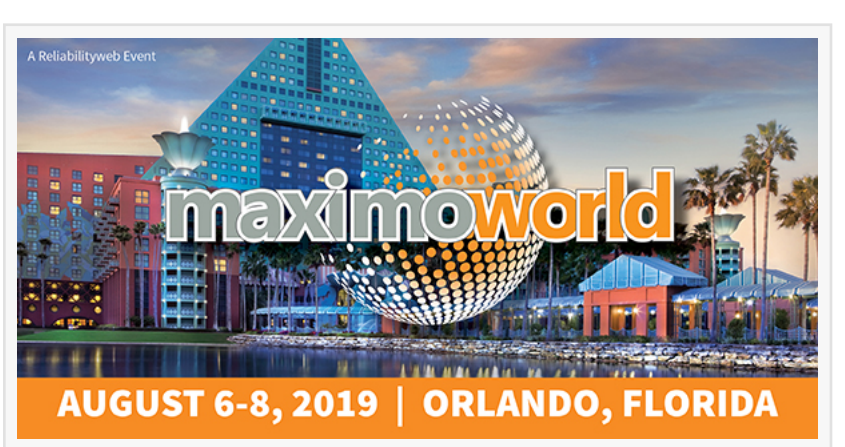
MaximoWorld 2019 will take place May 6-8 in Orlando, Florida

• The Asset Performance Management Summit, co-located with MaximoWorld, is designed to expand the functionality of current CMMS/EAM users who wish to expand their capability beyond work