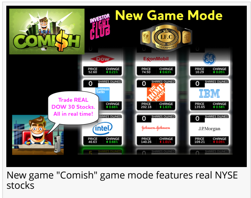
New game "Comish" game mode features real NYSE stocks

The goal of this mode is compete against other real players daily to see who can capture the highest portfolio gains and become that day's 'title belt' holder. Since this mode features real stocks trading at real prices, players who are familiar with day trading patterns will be able to utilize their knowledge and skills to gain an advantage.