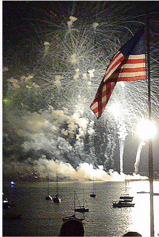
Perth and South Amboy are planning family-fun activities including amusement rides, food, games and music beginning at 6 pm.