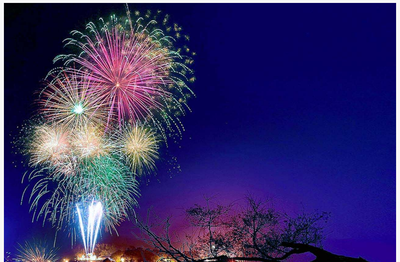
The Amboys are presenting an awesome fireworks display on July 3 to honor America's Independence Day.

PERTH AMBOY, NEW JERSEY, US, July 2, 2019 /EINPresswire.com/ -- Perth Amboy, South Amboy and the non-profit Celebrate Our Stars & Stripes Committee are presenting their spectacular fireworks display over Raritan Bay on Wednesday, July 3. Before the pyrotechnics begin, at about 9:30 p.m., each city is hosting family-friendly activities that will be fun for children of all ages. Everyone is invited to enjoy games, amusement rides, inflatable slides and bouncy houses, food and refreshments from vendors, music, and much more. The rain date for the fireworks show is Friday, July 5.