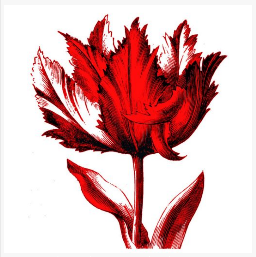
Intuition Salon and Spa: Natural and Organic Hair Care