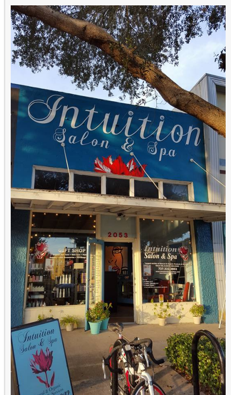
Intuition Salon and Spa: Natural and Organic Hair Care

[2] https://www.nfib.com/content/press-release/economy/small-business-job-creation-breaks-45-year-record/