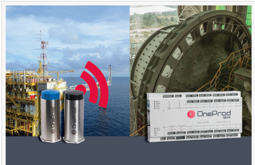
ONEPROD real-time monitoring [Eagle and MVX]

Raymond Lee Ecotech Pty Ltd +61 3 9730 7819 email us here Visit us on social media: Facebook Twitter LinkedIn