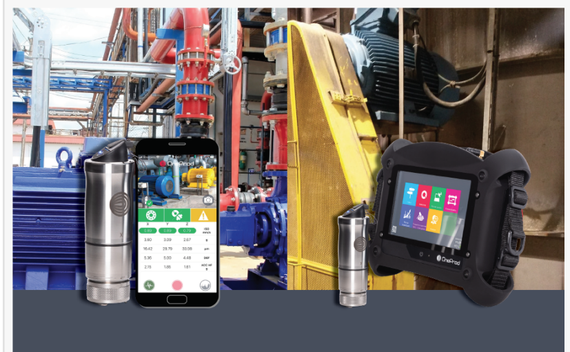
ONEPROD preventative check-up and portable data collection [Bearing Defender and Falcon].

MELBOURNE, VICTORIA, AUSTRALIA, July 4, 2019 /EINPresswire.com/ -- ECOTECH Pty Ltd , ACOEM's Australian subsidiary, is now helping to shape the longevity and sustainability of industrial and mining machinery across Australia and the Asia-Pacific region. The integration of Statewide Bearings' (SWB Plus) Condition Monitoring & Laser Alignment team into ECOTECH represents another step forward in ACOEM's mission to continually provide smart industry solutions for its customers on a global scale.