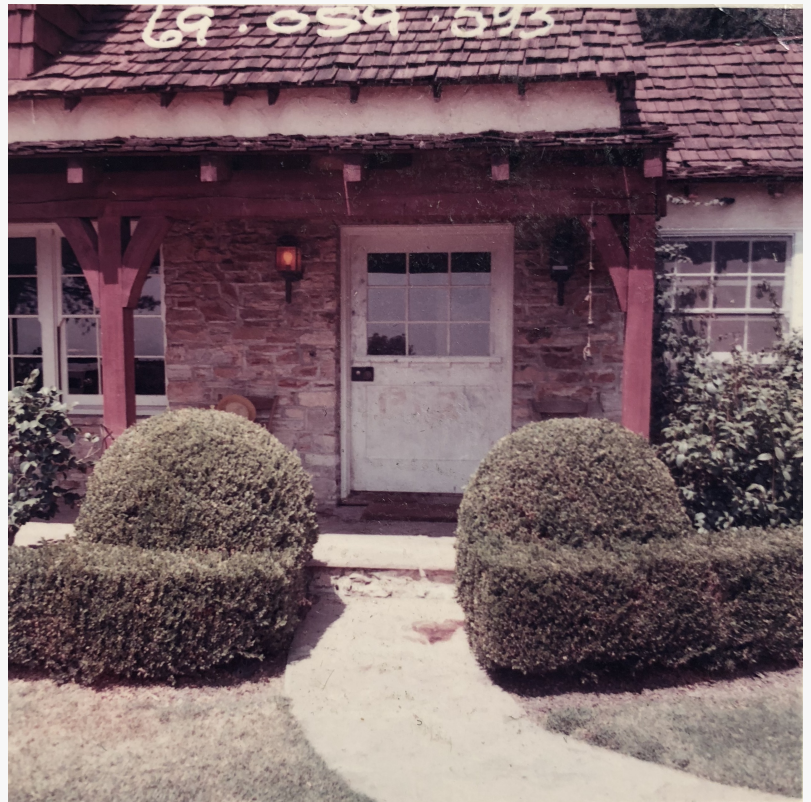
10050 Cielo Drive where Sharon Tate and four others were murdered