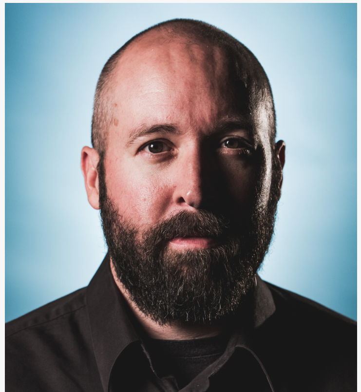
Author, James Buddy Day

EXPLOSIVE FIRST-HAND ACCOUNT FROM CHARLES MANSON'S FINAL INTERVIEWS THAT WILL CHANGE THE NARRATIVE OF THE MANSON FAMILY MURDERS