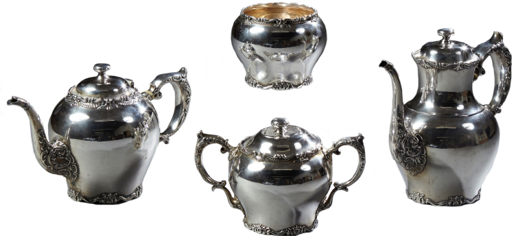
This early 20th century four-piece sterling tea and coffee set by Whiting features a 9-inch-tall coffee pot and has an estimate of $1,000-$2,000.