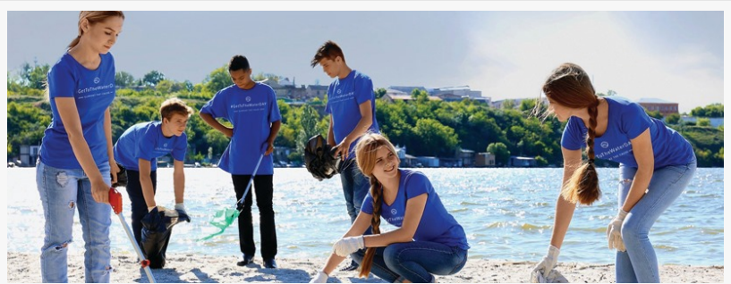
Start a cleanup group in your community