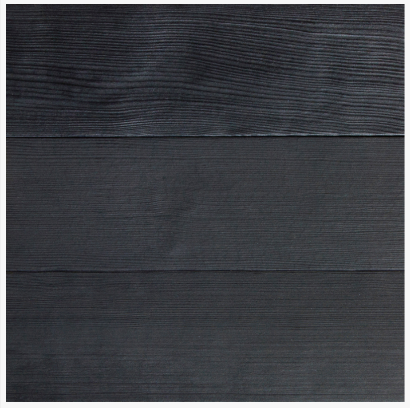
YAKIMA: CHARRED VERTICAL GRAIN WESTERN HEMLOCK

Most designs can be fire treated to Class A for interior projects.