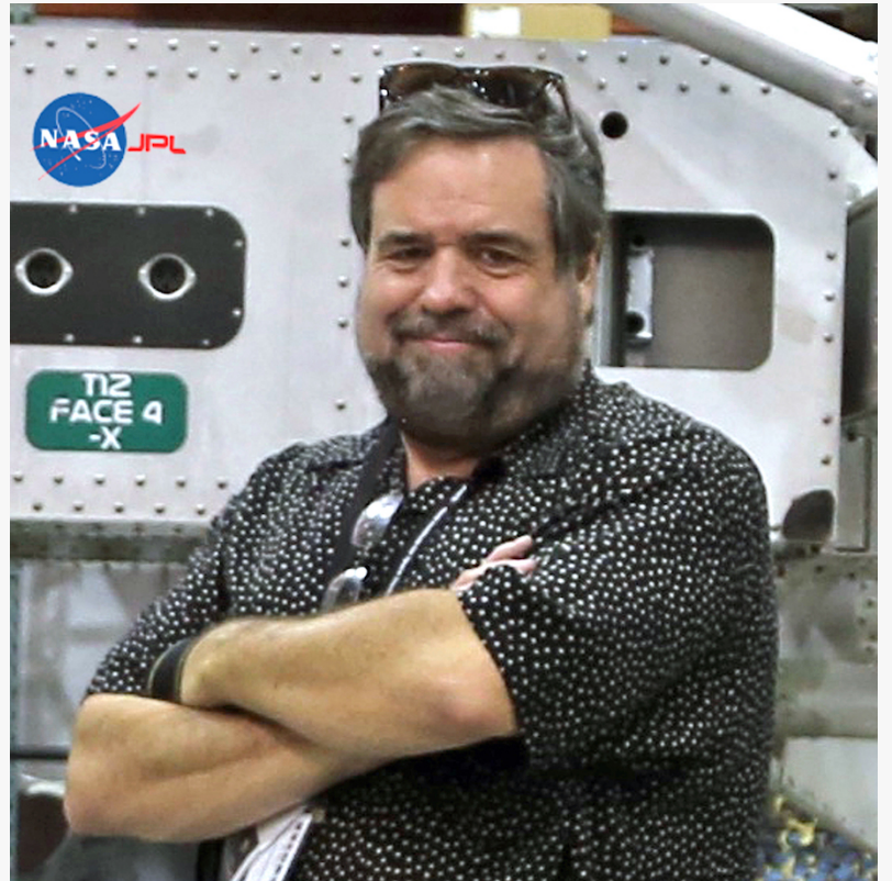
Author and journalist Rod Pyle at NASA's Jet Propulsion Laboratory. Credit: Rod Pyle

This press release can be viewed online at: http://www.einpresswire.com