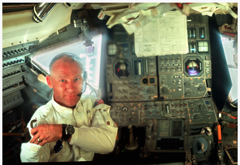
Previously unseen photo-composite of Aldrin in the Lunar Module prior to landing.