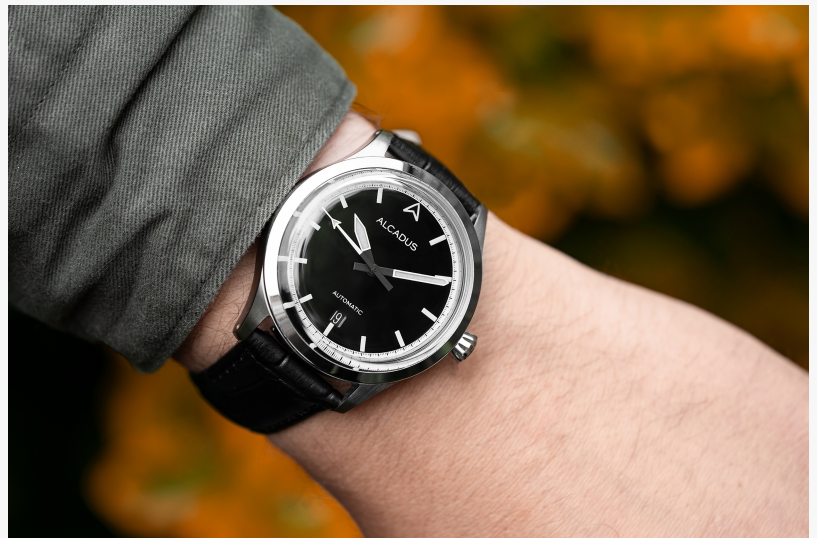
OPUS Jet Black