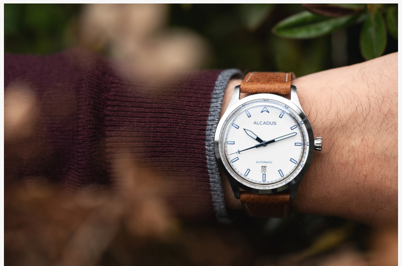
OPUS Argent White