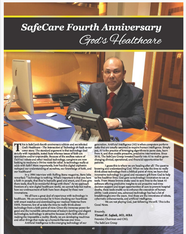
SafeCare 4th Anniversary Edition

This press release can be viewed online at: http://www.einpresswire.com