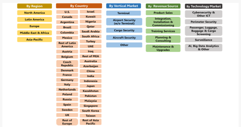
Aviation Security Market Segmentation Vectors of 230 Submarkets