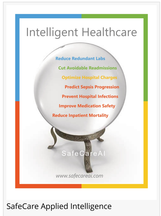
SafeCare Applied Intelligence