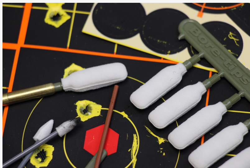
Swab-its Bore-tips Barrel Cleaning Swabs

This press release can be viewed online at: http://www.einpresswire.com