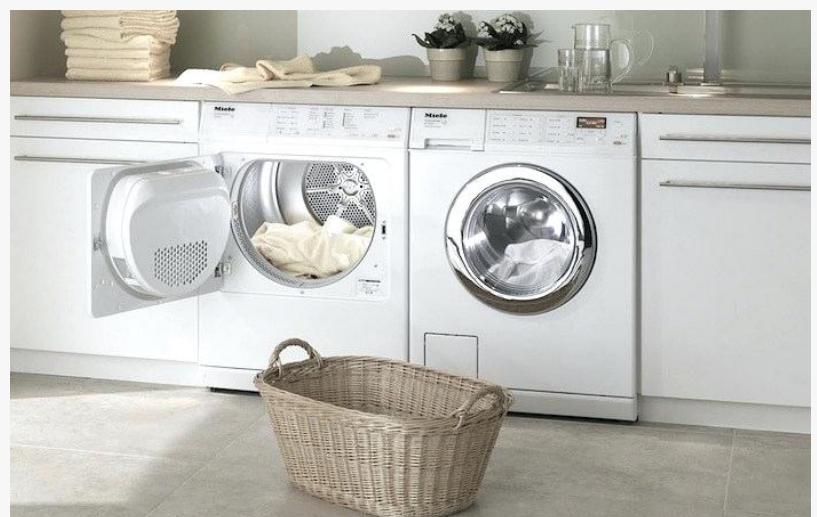
2 Days 2 X Rewards Event: Miele Washer and Dryer Pair