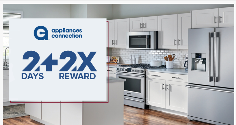
2 Days 2 X Rewards Event

Have you been thinking of upgrading your laundry room with a top-of-the-line washer and dryer pair ? Miele, one of the most sought-after brands in laundry has an amazing pair and we're selling it for $6644.00. This purchase would normally earn you 6,644 points or up to $66.44 toward future purchases. During our 2 Days 2 X Rewards event, you'll earn 13,288