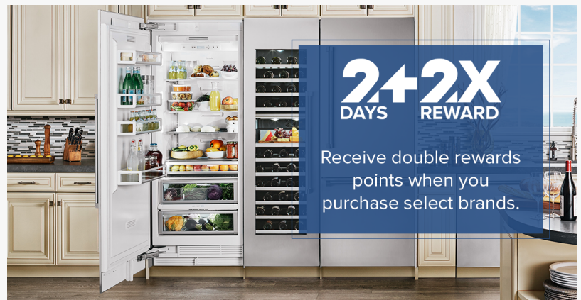
2 Days 2 X Rewards Event: Shop More, Earn More