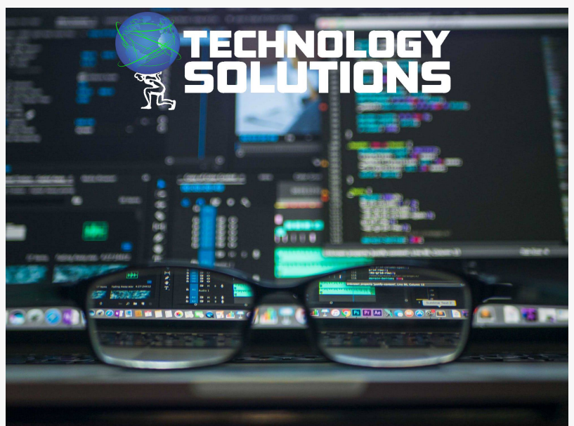
IT Solutions | Technology Solutions

Like it or not, information technology has become central – even essential – to business success, including companies right here in Toronto. That's why Technology Solutions MSP's outsourced IT services, which deliver unmatched expertise, reliability, and price, are now so important to its Toronto business partners.