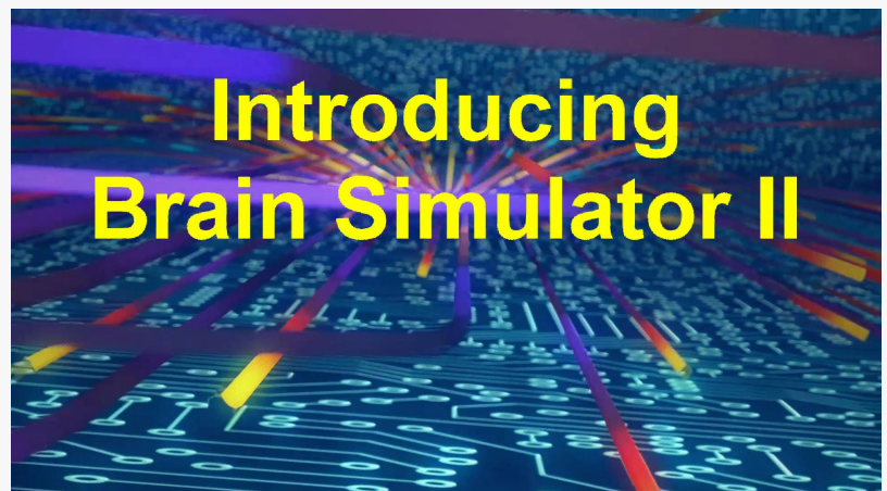
PlayList: Introducing Brain Simulator II