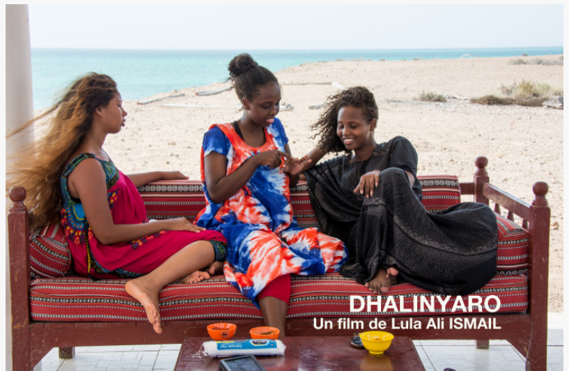
North American Premiere of "Dhalinyaro" from Djibouti - part of ADIFF DC 2019