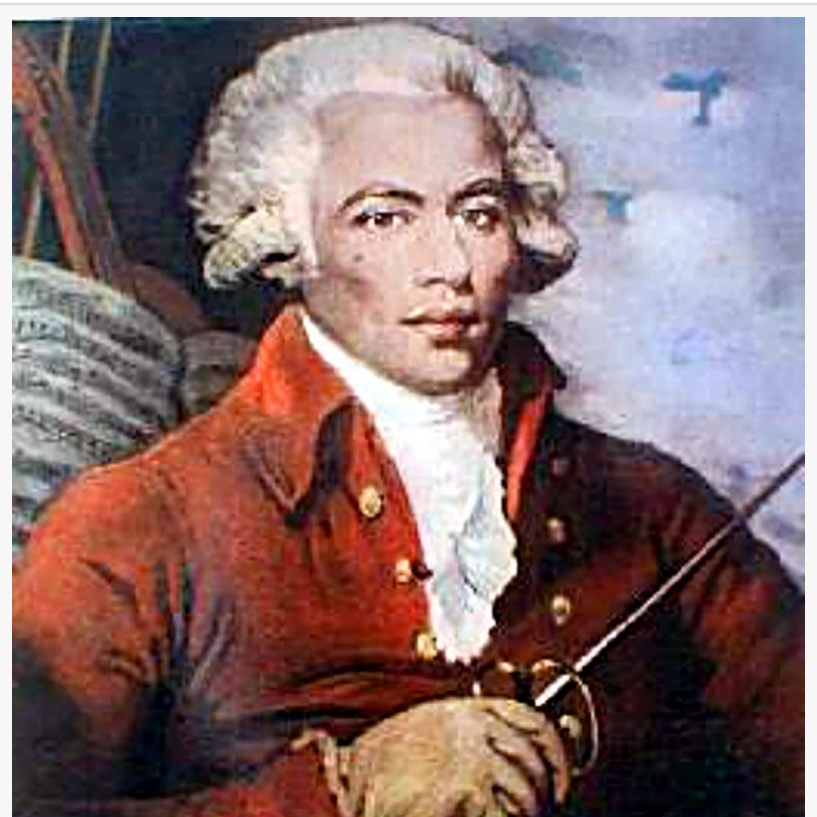
The Black Mozart in Cuba - part of ADIFF DC 2019