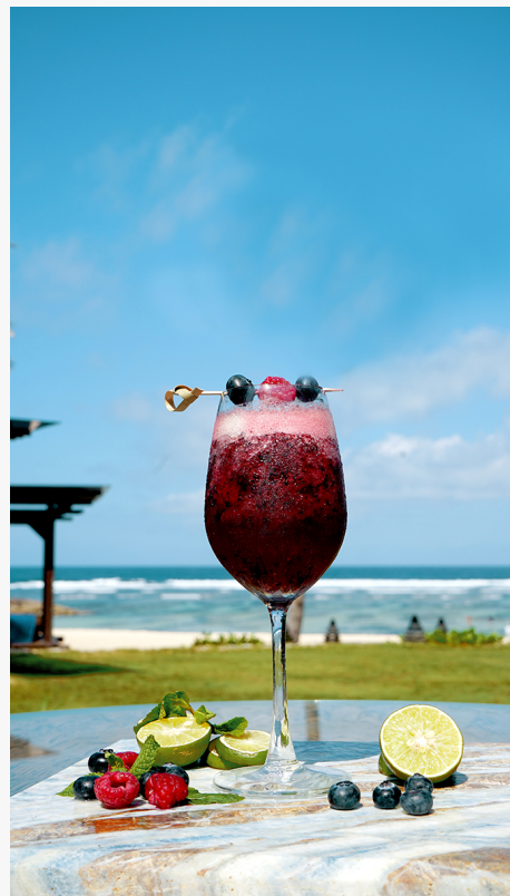
Matua Sangria, fresh berries combined with Pinot Noir