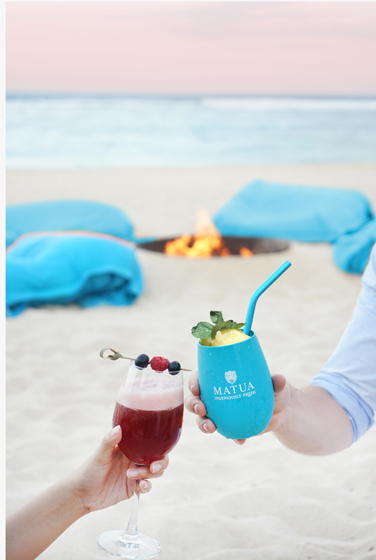
Toast to a delicious drinks over sunset