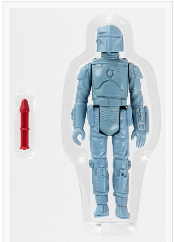
Rocket-firing Boba Fett prototype (L-slot) action figure, 3.75in., AFA 85 NM+ condition, Kenner, 1979. Sold for $112,926, the first Star Wars toy to sell for six figures. World auction record for any Star Wars toy.