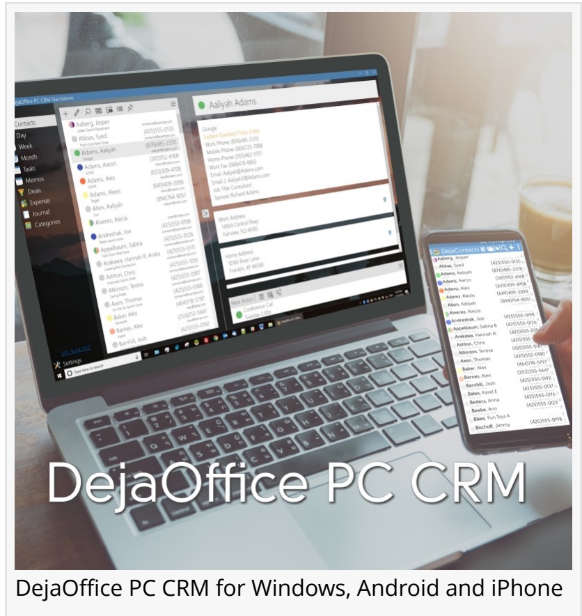
DejaOffice PC CRM for Windows, Android and iPhone

DejaOffice PC CRM offers a variety of solutions ranging from the Free CRM version to a full featured 20-user on-premise Customer Relations Manager. DejaOffice includes advanced Importing and Exporting features and automatically integrates with Outlook, Business Contact Manager, Google Calendar, Palm Desktop and other Customer Management platforms.