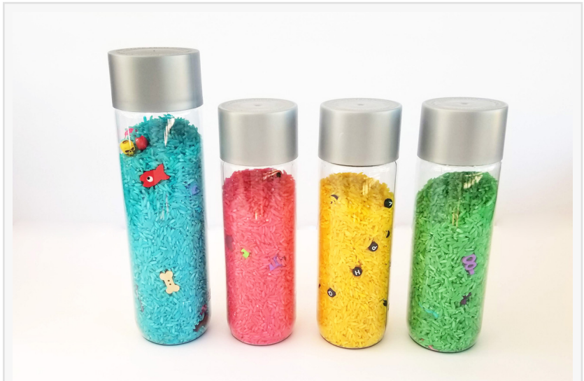
The Essential, Essential Mini, Alphabet Soup Mini and Count with me I spy bottles

Bottles also come in a variety of rice colors, to create the perfect bottle for each little learner, regardless of skill or gender. White rice makes it easy to find the trinkets, while the rainbow or single color rice presents more of a challenge. The letter and number trinkets featured in several bottles make learning letters and numbers fun.