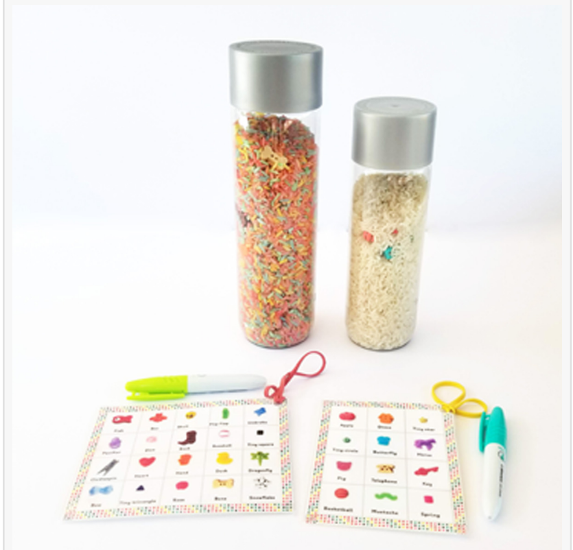
The Essential and Essential Mini with laminated picture cards