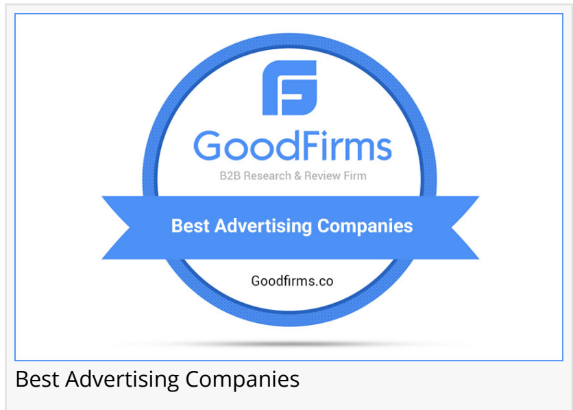
Best Advertising Companies

WASHINGTON DC, WASHINGTON, UNITED STATES, July 19, 2019 /EINPresswire.com/ -- These days, advertising has become a major key to the survival of new business, products, and services. It has also been recorded that the businesses are investing more and more in the marketing companies to increase their sales and revenue. But, today in the market, it has become difficult for the service seekers to fetch the right partner as there are numerous companies providing marketing services. Thus, GoodFirms has featured the list of Top Advertising Companies that are indexed along with genuine ratings and reviews.