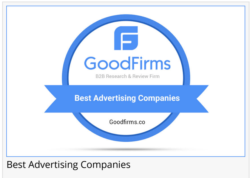
Best Advertising Companies

WASHINGTON DC, WASHINGTON, UNITED STATES, July 19, 2019 /EINPresswire.com/ -- These days, advertising has become a major key to the survival of new business, products, and services. It has also been recorded that the businesses are investing more and more in the marketing companies to increase their sales and revenue. But, today in the market, it has become difficult for the service seekers to fetch the right partner as there are numerous companies providing marketing services. Thus, GoodFirms has featured the list of Top Advertising Companies that are indexed along with genuine ratings and reviews.