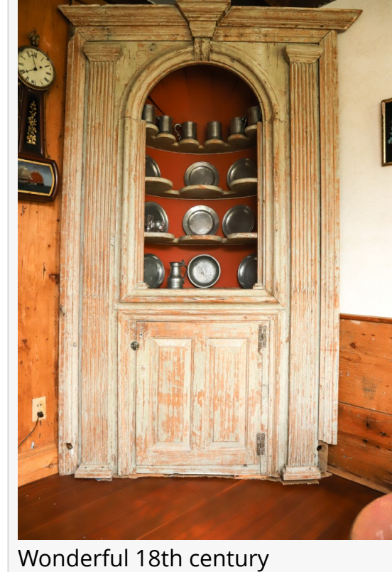
Wonderful 18th century architectural corner cupboard, free-standing with deep shaped shelves, fluted pilasters and paneled doors, 94 inches tall (est. $3,000-$5,000).

mcinnisauctions@yahoo.com. To learn more about John McInnis Auctioneers and the July 27th-28th on-site auction in East Boothbay, Maine, log on to <a href="https://www.mcinnisauctions.com">www.mcinnisauctions.com</a>.