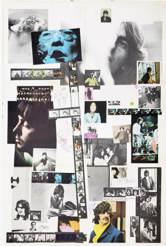
Beatles White Album insert with photos and other artwork, signed by all four of the Beatles, with a COA, measuring 36 inches by 24 inches (est. $10,000-$15,000).

Guillermo Miralles Miami Auction Gallery +1 888-352-8284 email us here