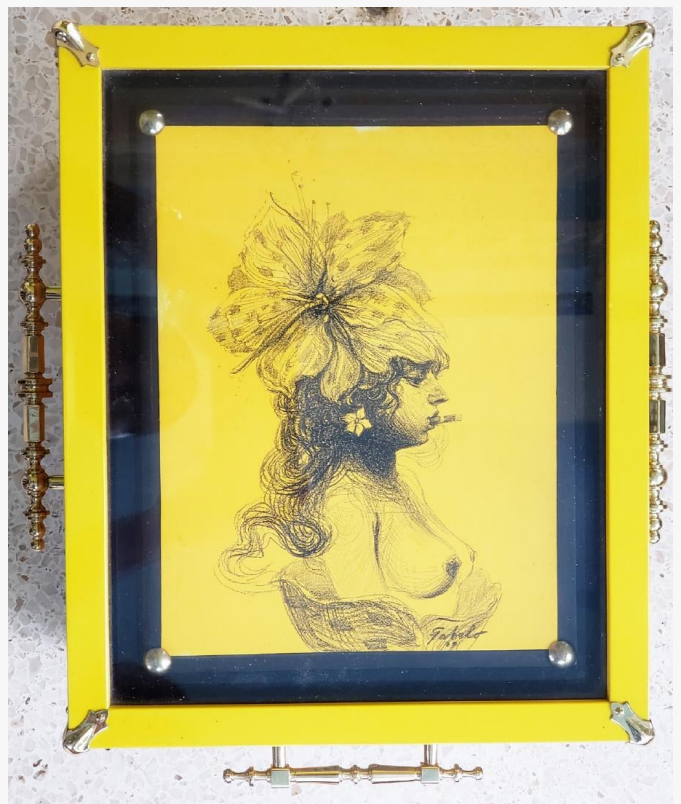
Crayon on wood and glass yellow humidor by Robert Fabelo (b. 1951), a beautiful one-of-a-kind item that comes with a certificate of authenticity (est. $15,000-$30,000).