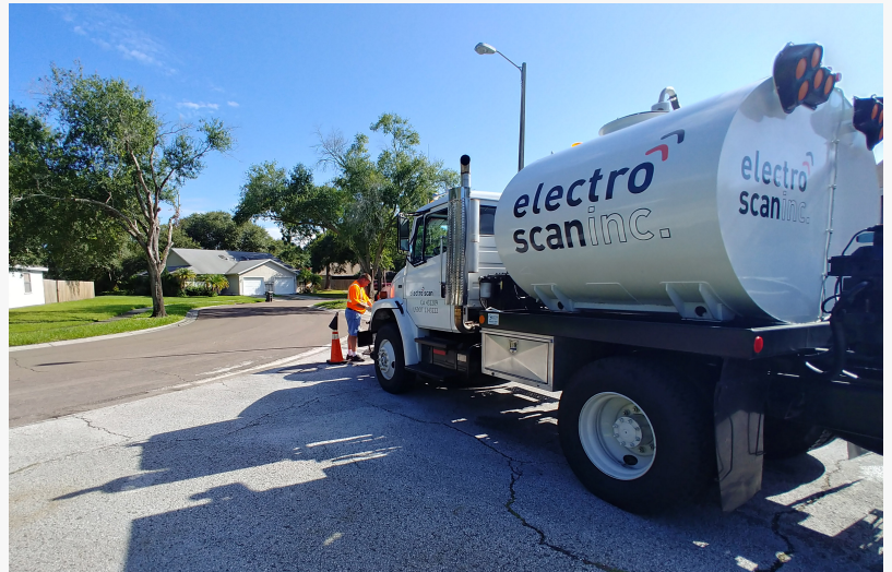
Electro Scan's Water Jet Truck simulates fully surcharged lines to pinpoint leak locations and severity.