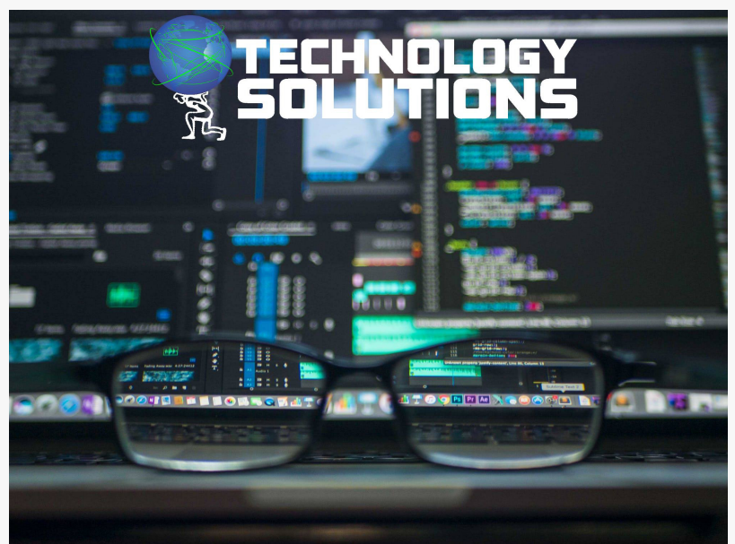
IT Solutions | Technology Solutions

Your new Technology Solutions MSP team will support your business with more than a century of combined experience and state-of-the-art knowledge. This allows them to deliver any type of