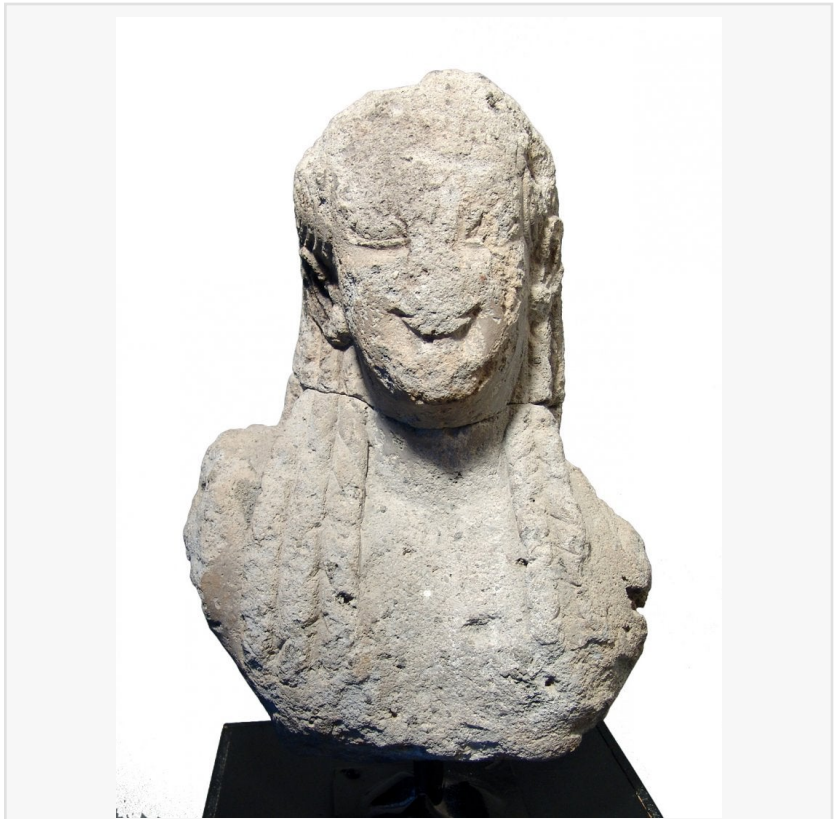
Large Archaic Greek stone head of a Kouros from the 6th century BC, with large, almond shaped eyes and hair in long curled locks, 19 inches tall by 14 inches wide (est. $18,000-$25,000).

Gabriel Vandervort Ancient Resource Auctions +1 818-425-9633 email us here