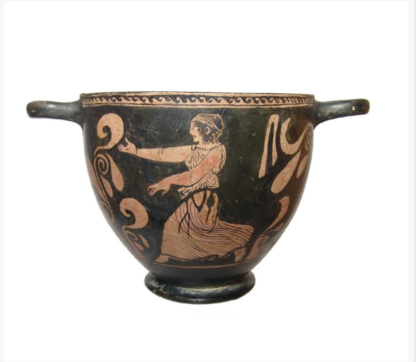
Greek Lucanian red-figure skyphos (deep, cup-shaped vessel with a pair of horizontal handles to the rim), possibly from the Intermediate Group (circa 400-375 BC) (est. $6,000-$9,000).

This press release can be viewed online at: http://www.einpresswire.com