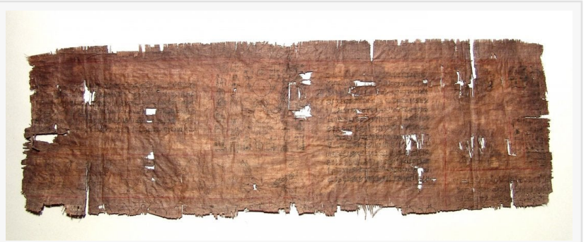
Actual papyrus page from an ancient Book of the Dead (Late Period to Ptolemaic, circa 664-30 BC), from a chapter between 64-129, 36 inches by 11 inches (est. $12,000-$20,000).