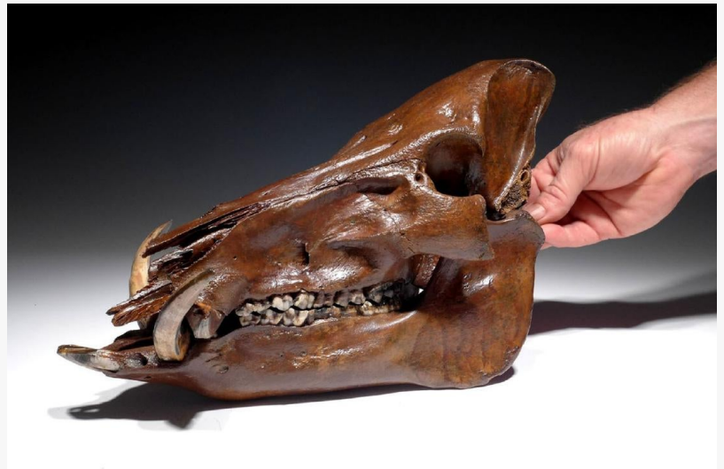
Remarkably well-preserved fossil skull of a wild boar from South Central Europe, dating back circa 8,500-16,500 years, to the Late Pleistocene or Mesolithic period (est. $15,000-$25,000).