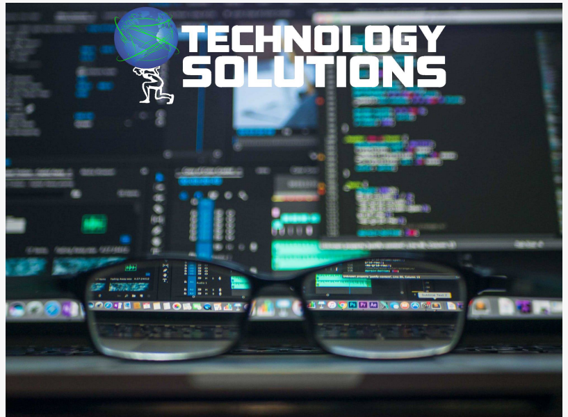
IT Solutions | Technology Solutions

Whether you're too busy to keep up with your IT needs, feeling overwhelmed by the onrush of technological advancements, or simply miffed that any of your competitors seem to be so far ahead of you in IT capabilities, Technology Solutions MSP is the perfect partner to bring into your corner and rely on.