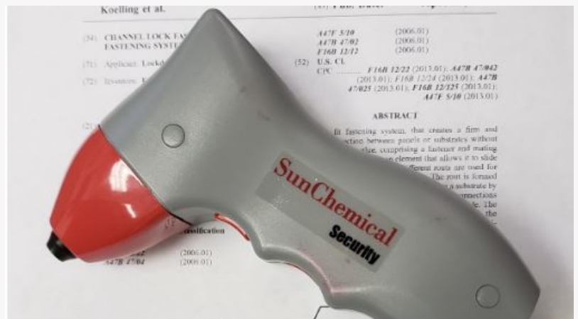
This taggant gun authenticates globally patented Lockdowel fasteners.