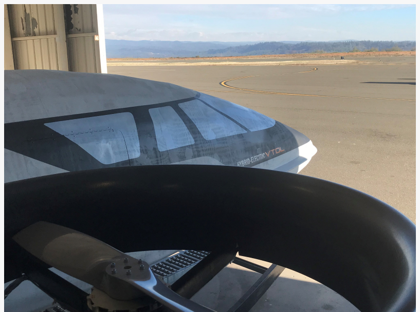
TriFan 600 Prototype

"We are excited to announce selection of the GE Catalyst engine for the core of our propulsion system because it provides the level of power required even at the significant altitudes the TriFan