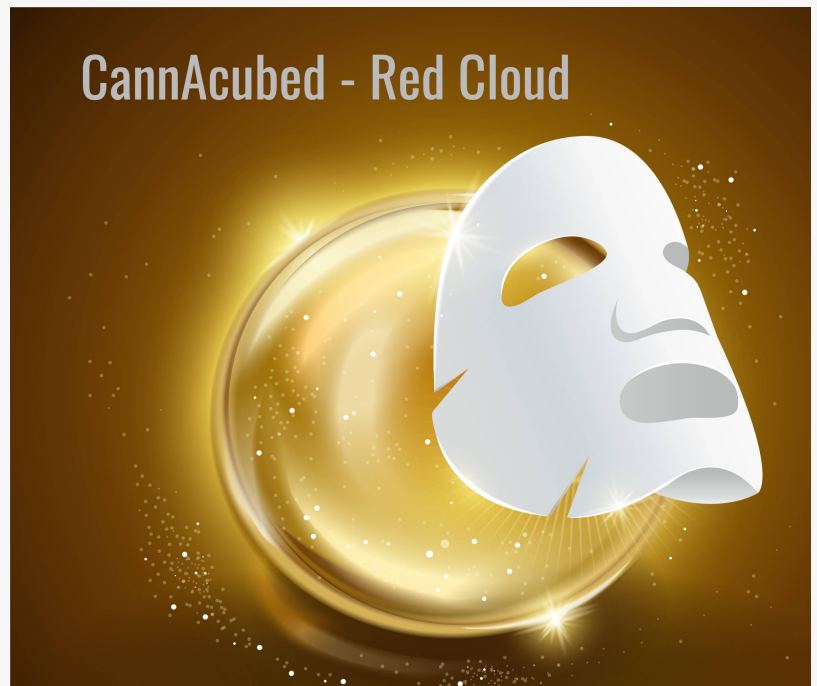
CBD Cosmetics taking off in Asia