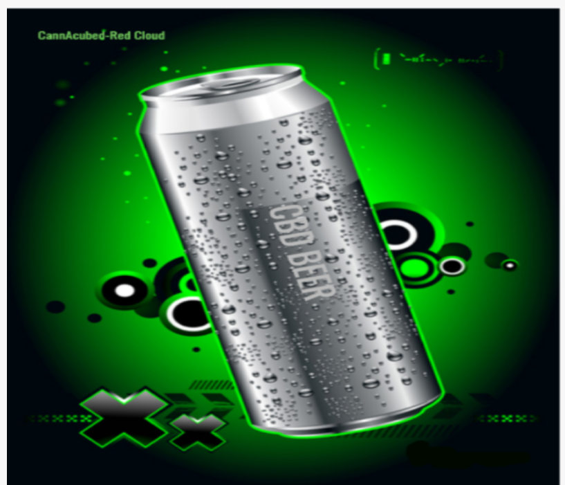
Asia's first CBD Beer in Development

CannAcubed is currently growing Industrial Hemp on just under 400 acres this year in Lufeng & Wuding in China and will export from Kunming where it is setting up its China head office. The company has access to over 200,000 hectares of land in China for growing and intends to scale up significantly in 2020 and beyond.