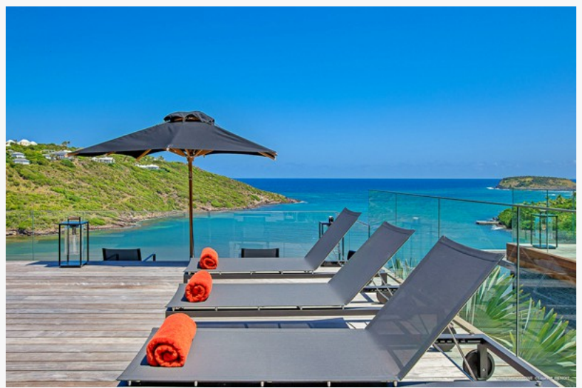
Luxury Villa in St Barths

Exceptional Villas is a luxury villa rental company featuring only the best hand-picked and personally inspected properties in the world. The company has clients from all over the world. Exceptional Villas have been in the travel business for over 25 years and offer a bespoke service to their clients. This service includes matching the perfect villa to each of their clients and providing complimentary concierge service. This service includes organizing all aspects of the client's vacations such as VIP airport arrival, ground transportation, restaurant reservations, tours and excursions, water sports and pre-arrival stocking. Unlike some of their competitors, they do not provide a membership fee. Likewise, their villa experts are indeed experts. They visit every single villa and have a wealth of information regarding each villa, as well as each destination.