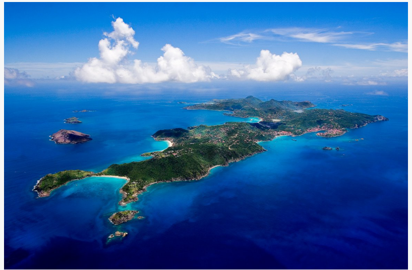
Aerial View of St Barts

Exceptional Villas, the world's most trusted villa rental company, have undertaken extensive research with their loyal and discerning clients together with their team members who also travel very extensively throughout the Caribbean each year. The results show that more than ever, safety is of the utmost importance when choosing where to spend their hard-earned vacation time. 80% of clients surveyed by Exceptional Villas state that feeling safe on vacation is the most important factor when planning where they choose to visit.