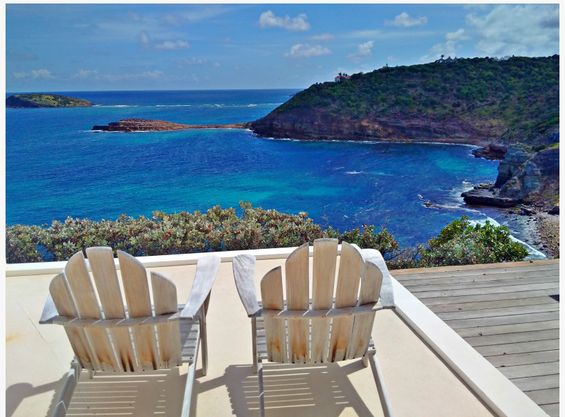
luxury villas in St Barts