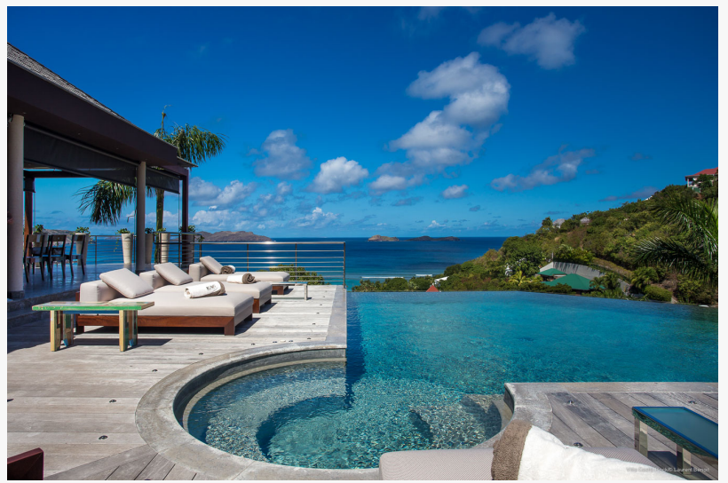
Luxury Villa St Barths

Alexandra Baradi Exceptional Villas +1 702-849-9849 email us here