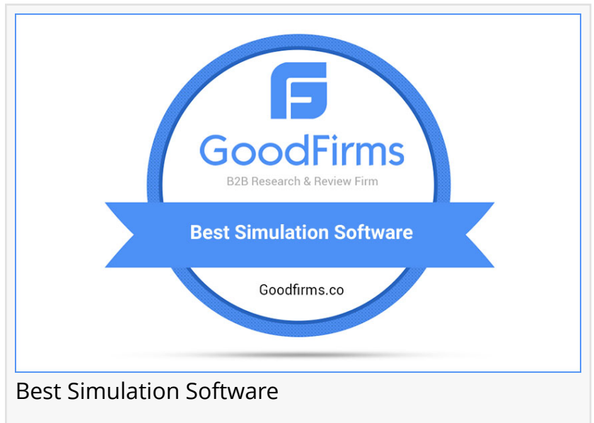
Best Simulation Software

WASHINGTON DC, WASHINGTON, UNITED STATES, July 26, 2019 /EINPresswire.com/ -- The simulation software is renowned for helping industries from various background fields such as material handling, healthcare, warehousing, mining, teaching, and manufacturing. Thus most of them are looking forward to the most excellent simulation tools to take the advantage of it by producing a model or imitating the operation of real-time products or systems to predict and visualize without actually conducting that operation.