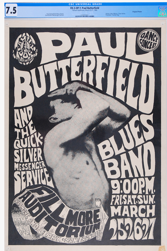
This FD-3 Paul Butterfield Blues Band Fillmore Auditorium 3/25/66 is being auctioned by Psychedelic Art Exchange