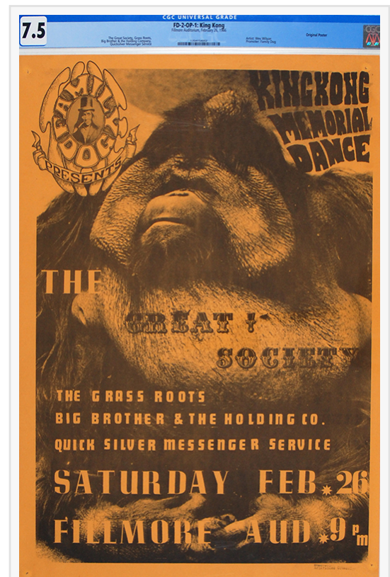
This FD-2 King Kong Memorial Dance Fillmore Auditorium 2/26/66 concert poster is being auctioned by Psychedelic Art Exchange

FD-1 Tribal Stomp concert handbill in museum quality condition, CGC graded 9.6. The vintage concert handbill promotes a show by Jefferson Airplane at the Fillmore Auditorium 2/19/66 and is by far the finest CGC graded example of the classic rarity to ever appear at public auction.