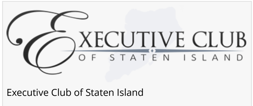
Executive Club of Staten Island

STATEN ISLAND, NEW YORK, USA, July 29, 2019 /EINPresswire.com/ -- Online videos of people throwing buckets of water at local law enforcement have recently surfaced across social media. This blatant disrespect of authority has caused outrage among both civilians and police officials nationwide. The Executive Club of Staten Island has launched the #hydrateheroes campaign to bring the community together and show their support and respect for law enforcement