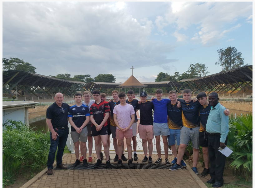
Students in Ireland Support Wells of Life