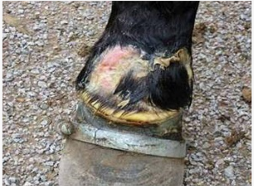
Example of soring that enforcement of the Horse Protection Act would prevent

Animal Wellness Action (Action) is a Washington, D.C.-based 501(c)(4) organization with a mission of helping animals by promoting legal standards forbidding cruelty. We champion causes that alleviate the suffering of companion animals, farm animals, and wildlife. We advocate for policies to stop dogfighting and cockfighting and other forms of malicious cruelty and to confront factory farming and other systemic forms of animal exploitation. To prevent cruelty, we promote enacting good public policies and we work to enforce those policies. To enact good laws, we must elect good lawmakers, and that's why we remind voters which candidates care about our