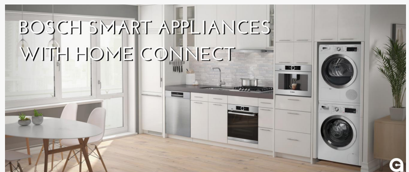
Appliances Connection 2019 Smart Appliances Smarter Savings Event: Bosch Home Connect