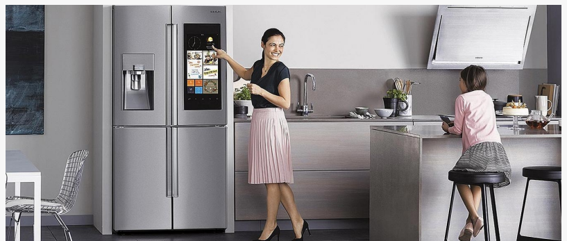
Appliances Connection 2019 Smart Appliances Smarter Savings Event: Samsung Family Hub