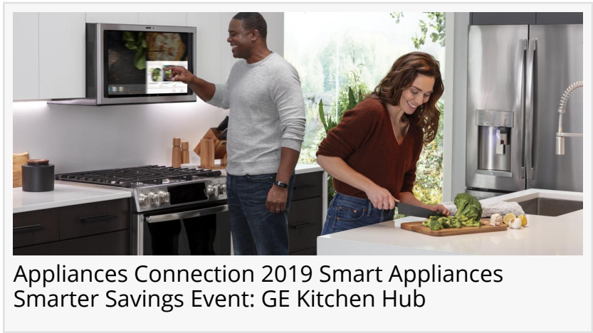
Appliances Connection 2019 Smart Appliances Smarter Savings Event: GE Kitchen Hub

You won't have to rush to the door when you're in the middle of kitchen tasks.