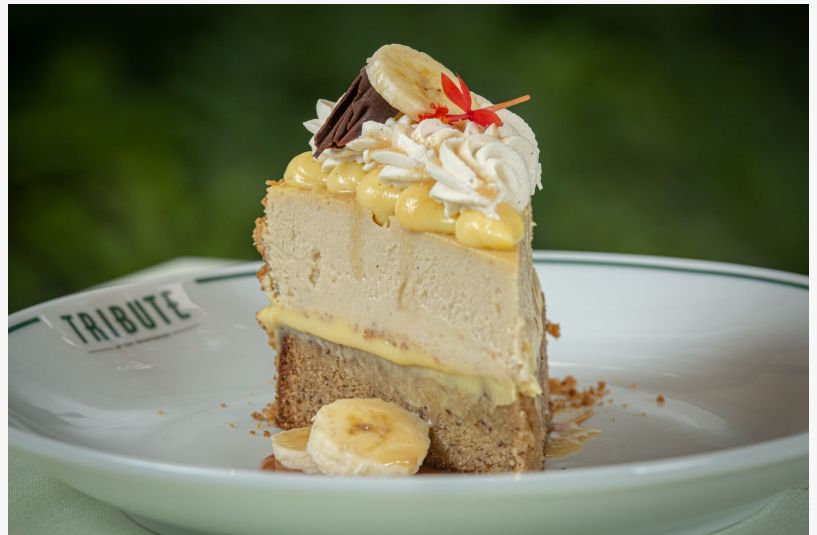
Bananas Foster Cake available at The Houstonian's TRIBUTE for the month of August.

"This dessert pays tribute to my south Alabama grandmother's banana