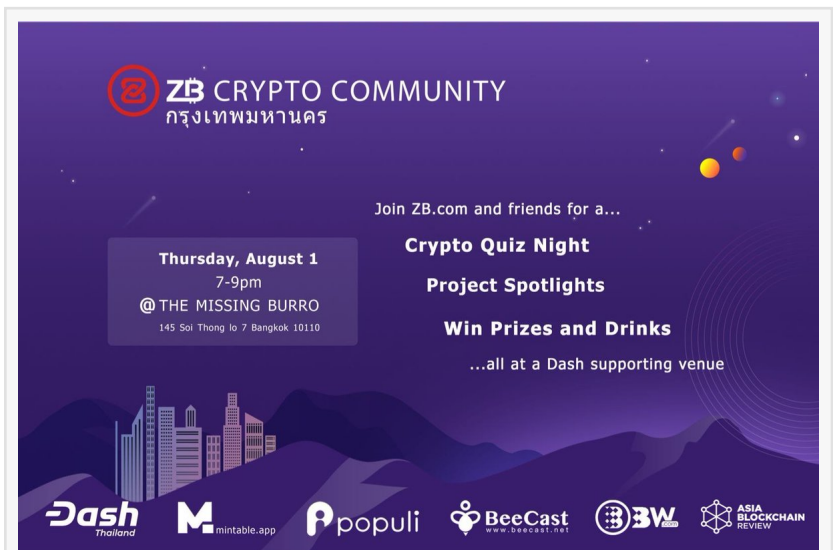
Poster for ZB community meetup in Thailand

ZB puts a high priority on innovation that can be seen with the recent launch of ZB Nexus for industry research and deep analysis. The focus on innovation is also put into practice by applying blockchain technology to our own activities whenever possible. For example, last night's event was the first of its kind to offer each guest a collectible non-fungible token (ERC-721). There were only 40 of these tokens minted and they will live on the Ethereum blockchain into eternity. Each token contains artwork to commemorate the meetup and all the partners involved.