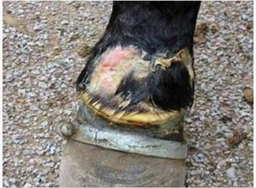
Example of soring that enforcement of the Horse Protection Act would prevent

This press release can be viewed online at: http://www.einpresswire.com