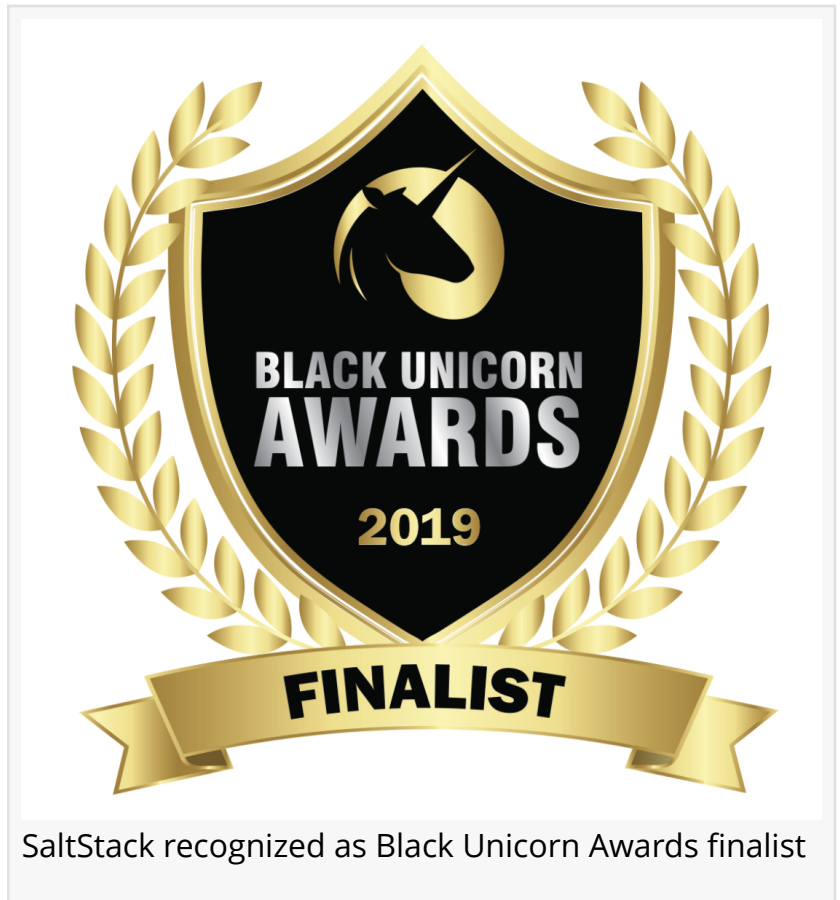
SaltStack recognized as Black Unicorn Awards finalist

and secure any data center infrastructure including public and private cloud infrastructure, network devices, any operating system, Kubernetes or Docker containerized environments, and more.