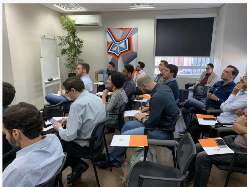
ZB Talk Meetup in Alphaville — Brazil