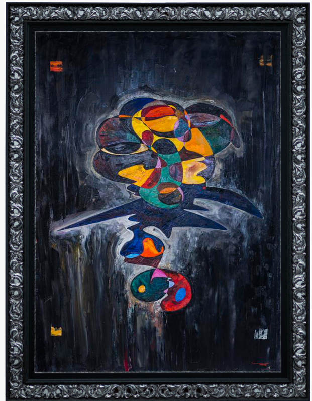
The Magician (2016)